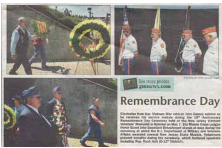
from May 12, 2011 issue of Independent.