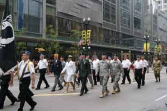
UAV Contingency at Chicago Memorial Day Parade