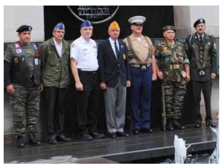
At the Vietnam Memorial Wall in Chicago, IL