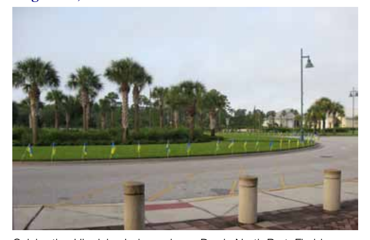
Celebrating Ukrainian Independence Day in North Port, Florida