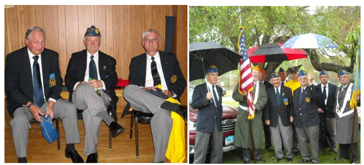
APRIL 22, 2012 ST. THOMAS SUNDAY IN SOUTH BOUND BROOK, NJ

Next time you are in our town – do stop by! You will be glad you did.