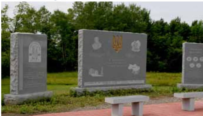
Newly blessed Ukrainian monument at St. Nicholas Ukrainian Cemetery in Amsterdam, New York

On May 6, 2012, a moving ceremony took place at St. Nicholas Ukrainian Cemetery in Amsterdam, NY, as a monument comprising of three solid granite slabs was blessed and dedicated in honor of all Ukrainian people who struggled to survive and fought for freedom in the old country and of the Ukrainian immigrants who toiled and struggled to make a new life in this country.