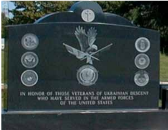
UAV Monument at Holy Spirit Ukrainian Catholic Cemetery, Hamptonburgh, N.Y. with walkway and plaques.