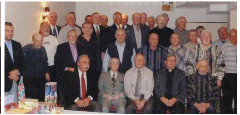
Post 24 members at Christmas Party on 12-18-11