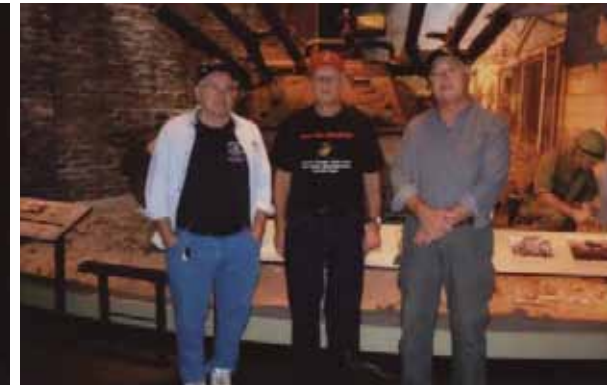
Anniversary banquet, Oct. 21, 2012, Parma, OH