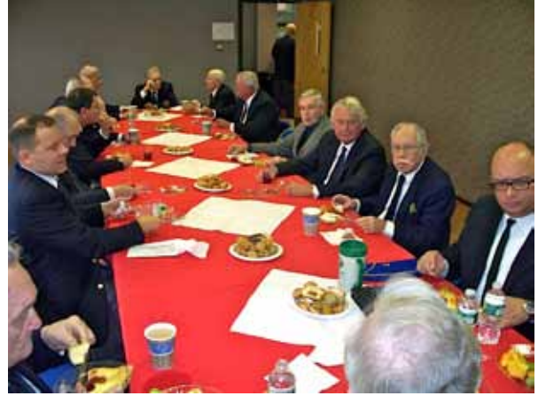
UAV Post 1 members during the reception.