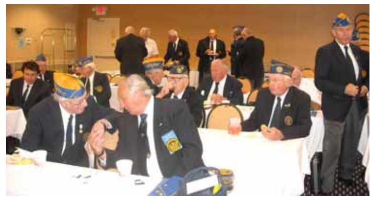
Delegates deliberating ...