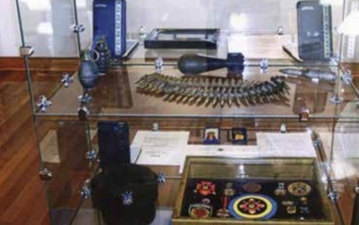
UAV Post 24 Military Exhibit had a successful showing from Nov 8, 2013 to Feb 15, 2014 at the Ukrainian Museum & Archives in Cleveland. Veteran pictures from WWII, Vietnam, Iraq & Afganistan were exhibited, plus medals, uniforms, flags, painting and weapons, etc.

April 22-24, 2014, some of our members visited the Dayton Air Force Museum. In Dayton, Ohio, where airplanes from different eras were on display.