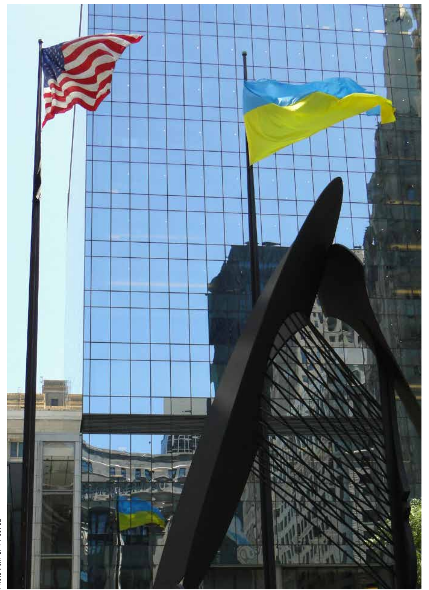
\hbox{August 24, 2014 - Ukrainian Independence Day - both flags fly high at the Daley Center with the Picasso in the front.}