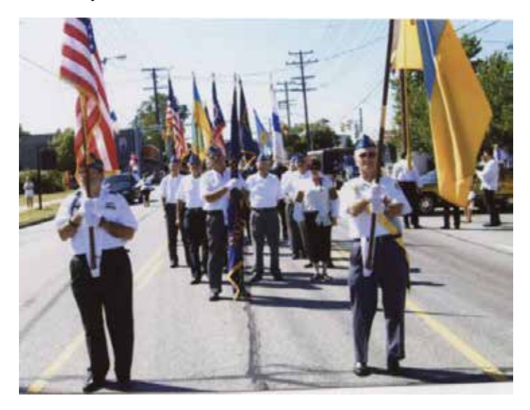
On Aug. 24, 2013 the Ukrainian village Parade held its 4th annual Ukrainian Indepence Day in Parma. Our Post 24 veterans were honored as the parade's first grand marchalls. We had over 60 organizations including three band and various veteran groups that participated.

August 24, 2013. Post 24 members participated in the 4th Annual Ukrainian Independence Day parade, which was organized by the Ukrainian Village Committee and was held at the Ukrainian Village in Parma, Ohio. Over sixty organizations, including three bands and various veteran groups, also participated in this event. UAV Post 24 veterans were honored as the parade's first Grand Marshalls. Plans are in the making for the 5th Annual Ukrainian Independence Day parade to be held this year.