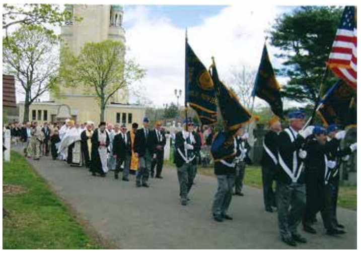
UAV Color Guard leads the procession.

After the services, the UAV Color Guard paid special homage at the UPA Memorial, ending their march at the future UAV National Monument site.