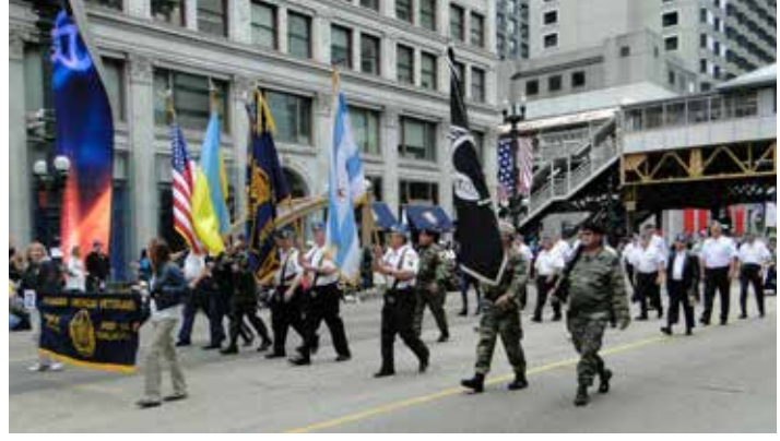
Ukrainian American Veterans Post 32 Chicago, march down the famous State Street the Great Street.