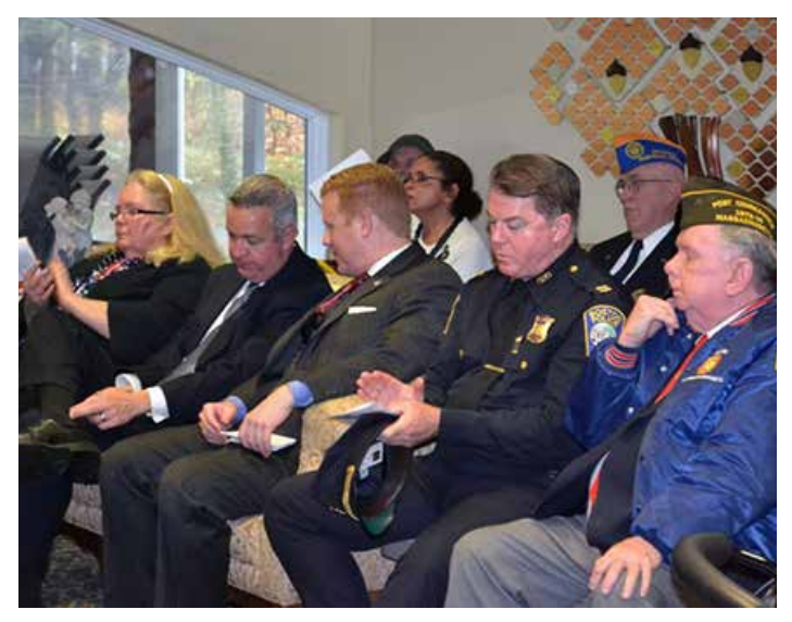
Special guests at Deutsches Altenheim event