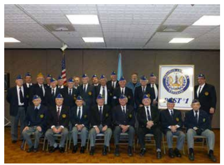
UAV Post 1 members

Thank you for the prosthetic, which was paid for by the Ukrainian-American community of the United States through the efforts of the "United Ukrainian American Relief Committee" (UUARC or ZUADK) and thank you to the official representative of Touch Bionics.