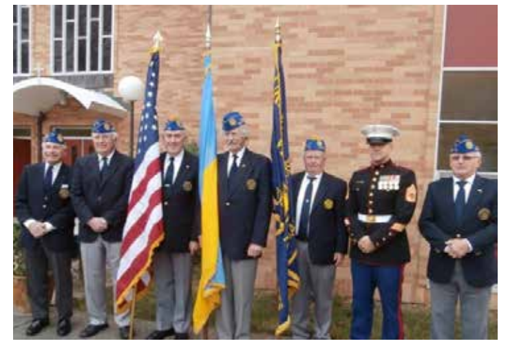
Novemeber 11, 2015. UAV Post 31 members

And that, ladies and gentlemen, state and local dignitaries, and my fellow veterans, is the story of how I became a veteran of the US Armed Forces. Please be aware that I was not an American citizen when I signed on that famous dotted line to join the USAF. I became a naturalized citizen of the United States of America shortly after my discharge from the USAF in 1965.