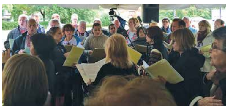
SUM Choir of Chicago