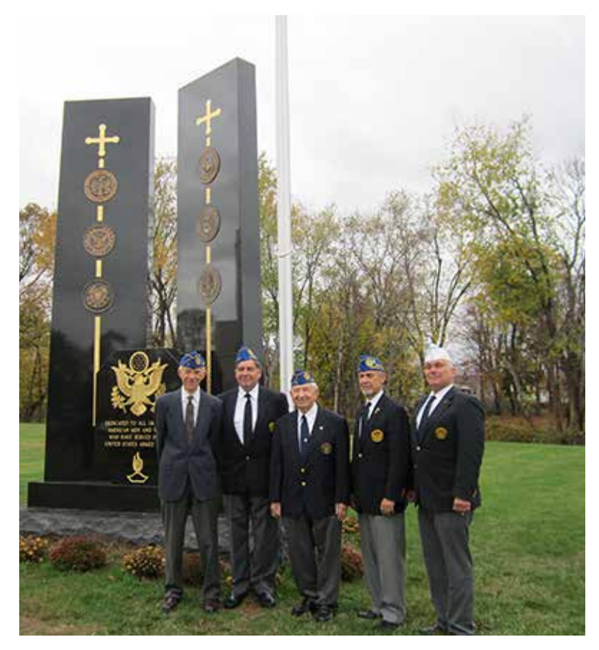
UAV NJ Department of State members