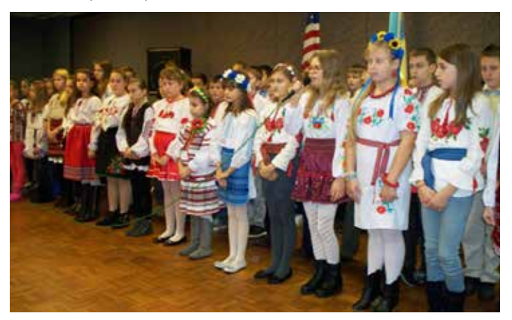
Veteran's Day - Children from the Heritage School

The UECC and the Ukrainian Self Reliance FCU of Philadelphia, PA., hosted the luncheon. Students of the Heritage School performed in Ukrainian dress; they spoke and sang in Ukrainian. It was a moving event and UAV Post 1 members are grateful to be thus remembered and honored in their own community each year.