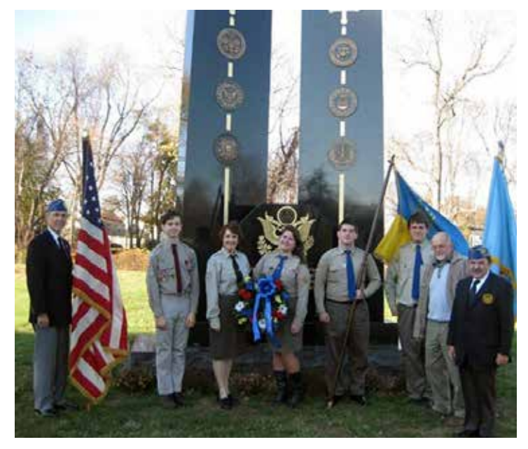
November 15, 2015, at the UAV National Monument

UAV Post 17 leadership and members have decided to make these commemorative ceremonies an annual event that will take place on each forthcoming Veterans Day on November 11.