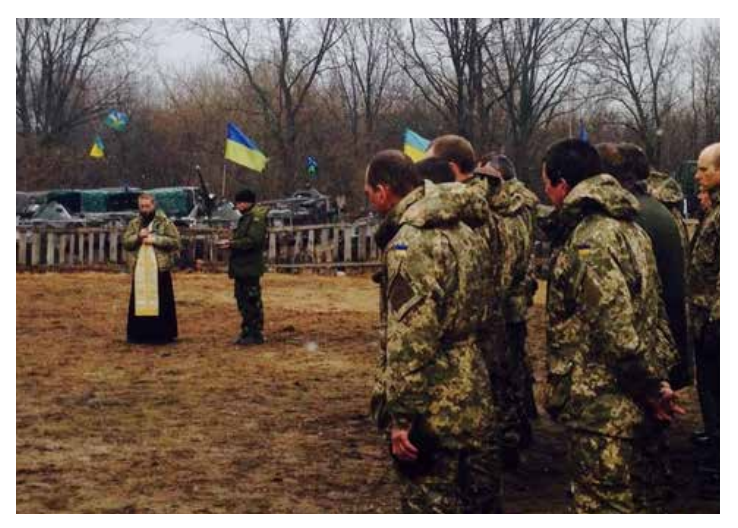
"An outdoor prayer"