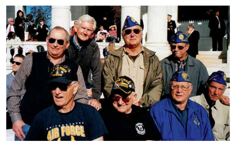
Veterans Day - November 11, 2015, UAV Post 24 members in Arlington National Cemetery, VA