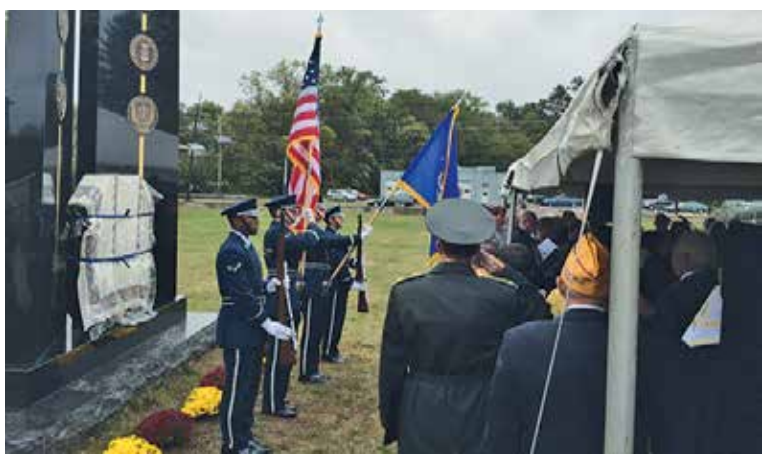
USAF Color Guard of McGuire Air Force Base in N. J.