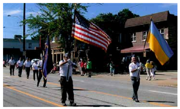
August 22, 2015. Ukrainian Independence Day parade in the Ukrainian Village