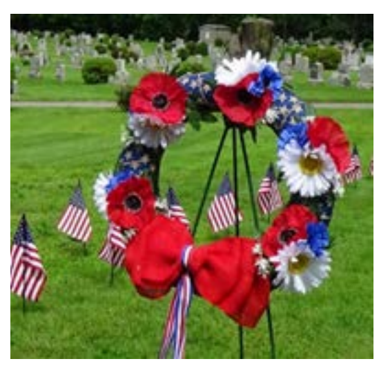
St. Mary's Cemetery