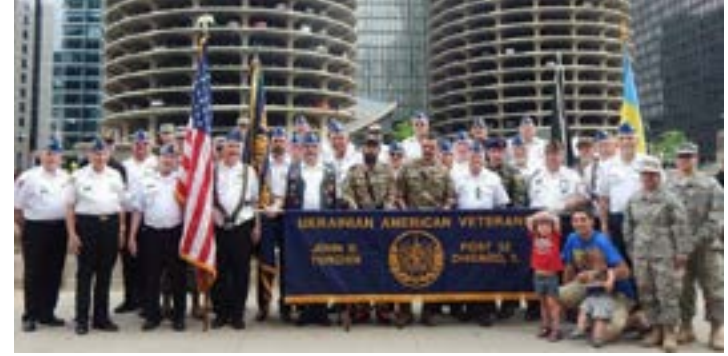
Group photo with everyone who participated in the Memorial Day Parade, with Marina Twin Towers in the backround.