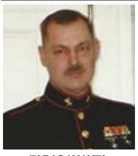
TARAS KALYTA 1946–2016