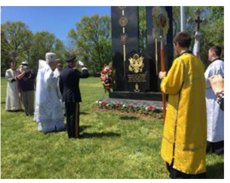
Wreath laying ceremony