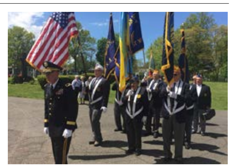
UAV Color Guard