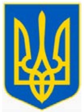
Ukraine Coat of Arms

We bow our heads to them and to all who were killed by terrorists, beginning with "The Heavenly 100" who perished on Euro-Maidan in Kyiv and extending to the ATO warriors killed in action in Eastern