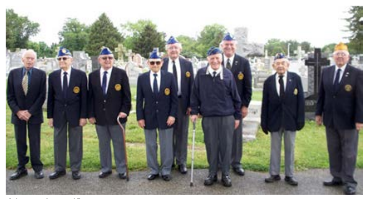
A few good men of Post #1