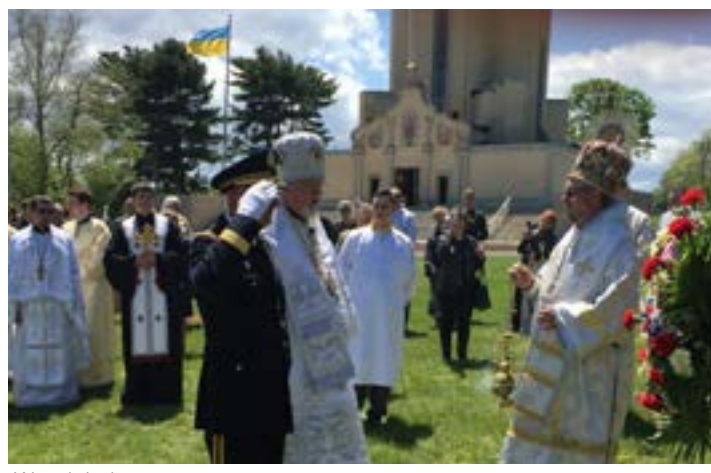
Wreath laying ceremony