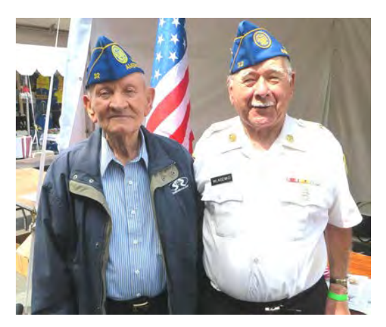
WE WANT YOU FOR THE UAV

8433 N. Clifton Ave. Niles, IL 60714-1803