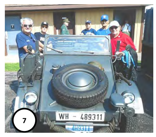
Post 24 members inspecting WW II materials.