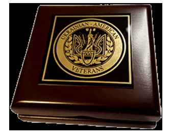
UAV Monument Coin in case - $30.00